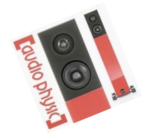
Code: X. If 'x' marked the spot, what did it signify? With the Avanti showing up in matching reddish-brown stripes, the same gene pool was even more in the eye. Sonically, reality and expectations met head-on. Still in their boxes, manoeuvring the newcomers into the sound room demonstrated noticeable weight loss versus the bigger brother. Once playing, this manifested in what sounded like a livelier cabinet, becoming audible particularly in the woofer's upper end. By contrast, the power range wasn't as tautly controlled. Against the drier Codex, it was bloomier. By lacking the extra cone area in the vital transition between midband and bass, perceptional emphasis moved up. Because spec sacrifices in bass reach registered little, the tonal upshift and looser power zone textures caused a bit of hollowness and some whiff-of-port redolence. The upshot was that the Avanti sounded brighter and more forward. Neither was it as unflappable about concealing the mechanical pressure effects of its woofer. Its workings were more apparent whereas that of the Codex was for all intents and purposes invisible. I didn't hear its box. With the Avanti's bass, I did at the SPL our room liked.